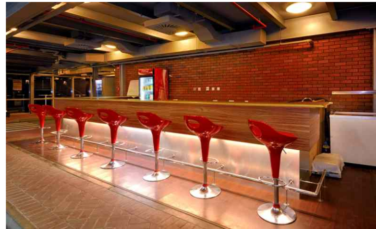
Juice bar in Cafeteria