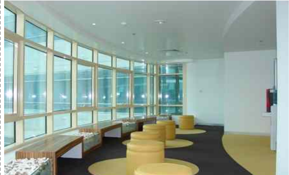
Breakout areas (Accessible from both buildings)