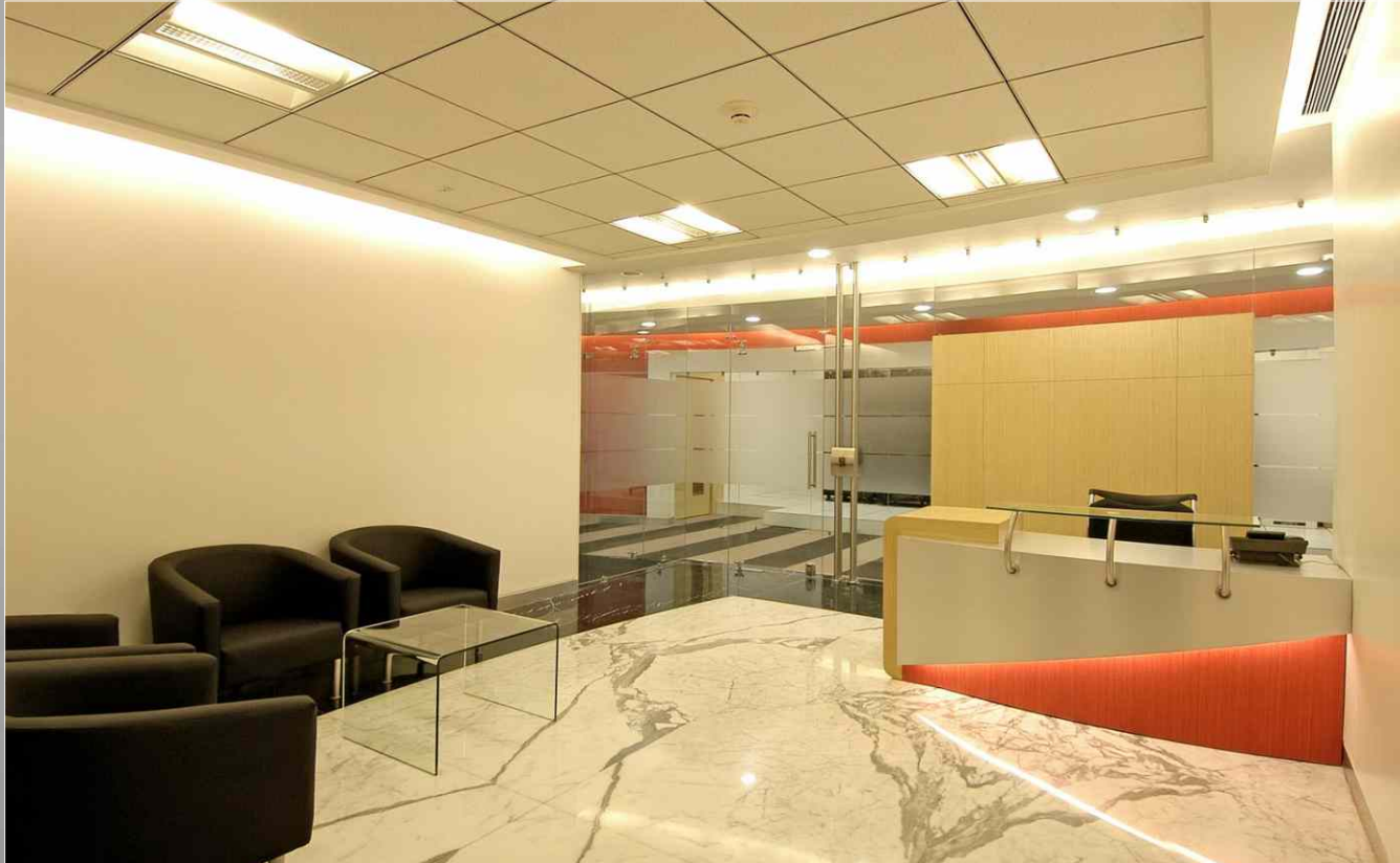
+ Main reception area