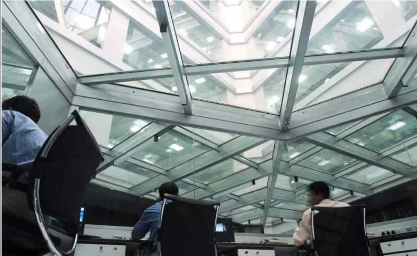
+ Data centre