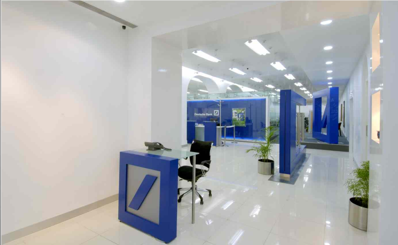
+ Main entrance