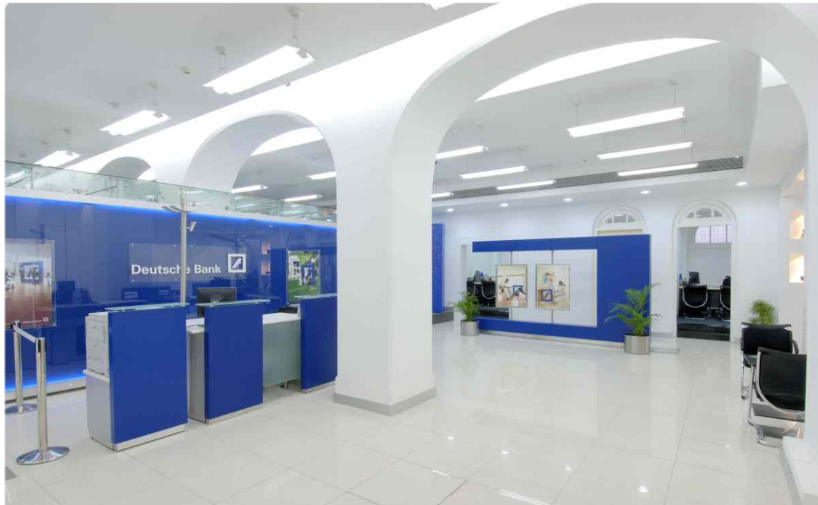
Teller counter area