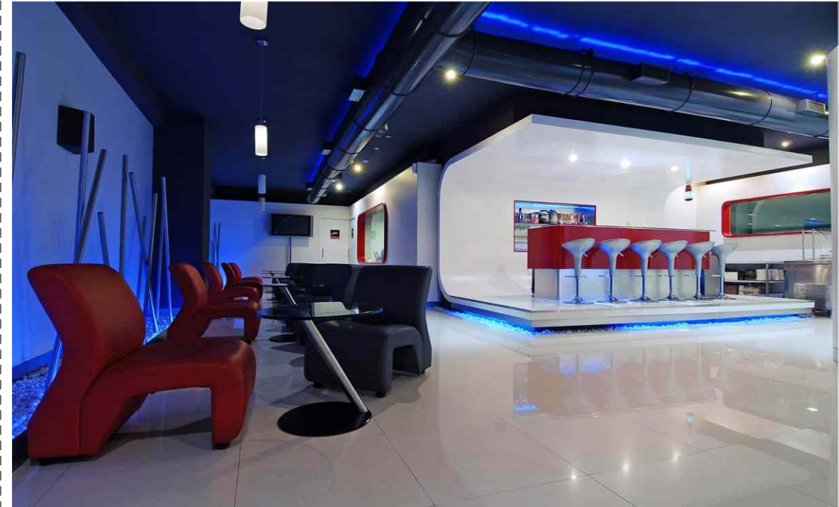
Recreation & Gymnasium