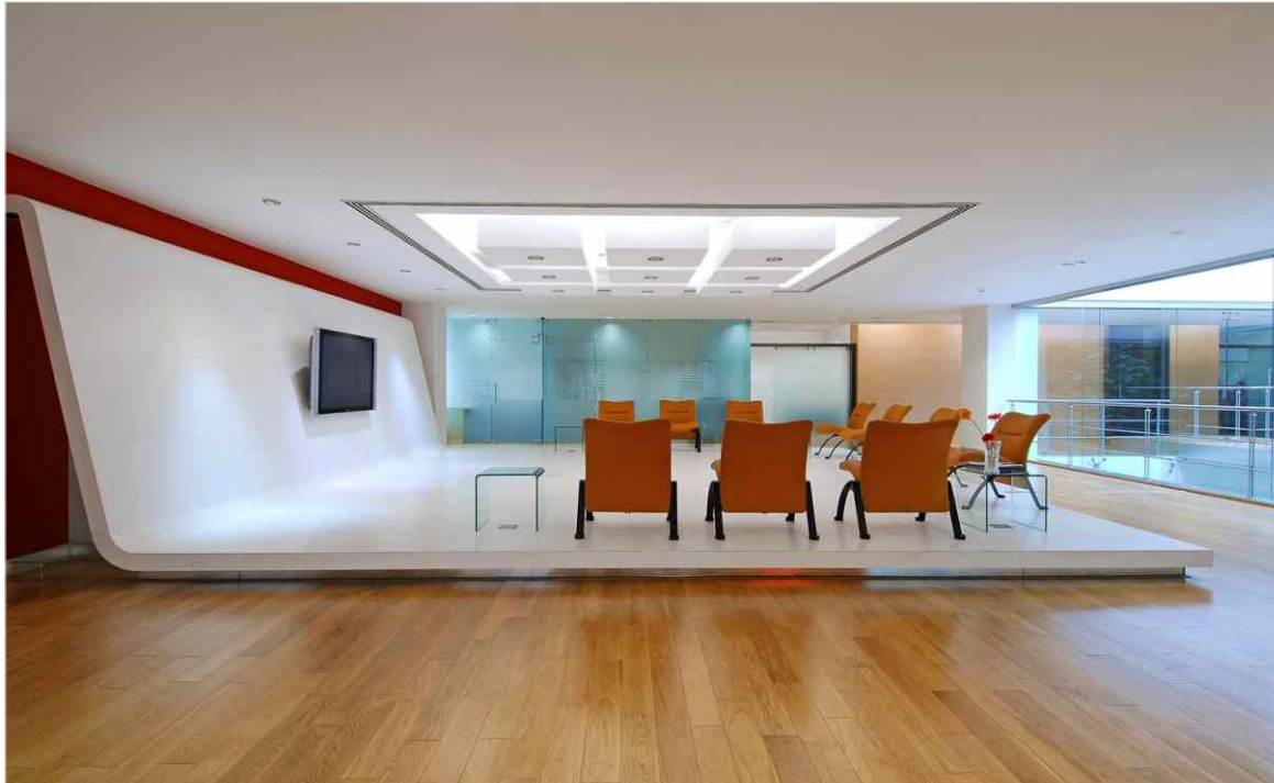
Corporate waiting lounge