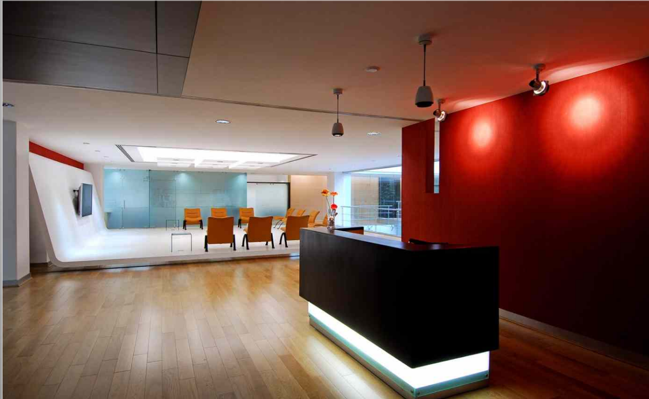
+ Corporate Reception