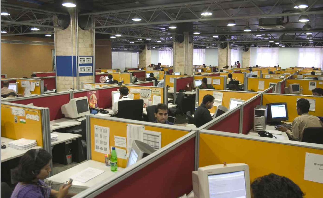
+ Office area