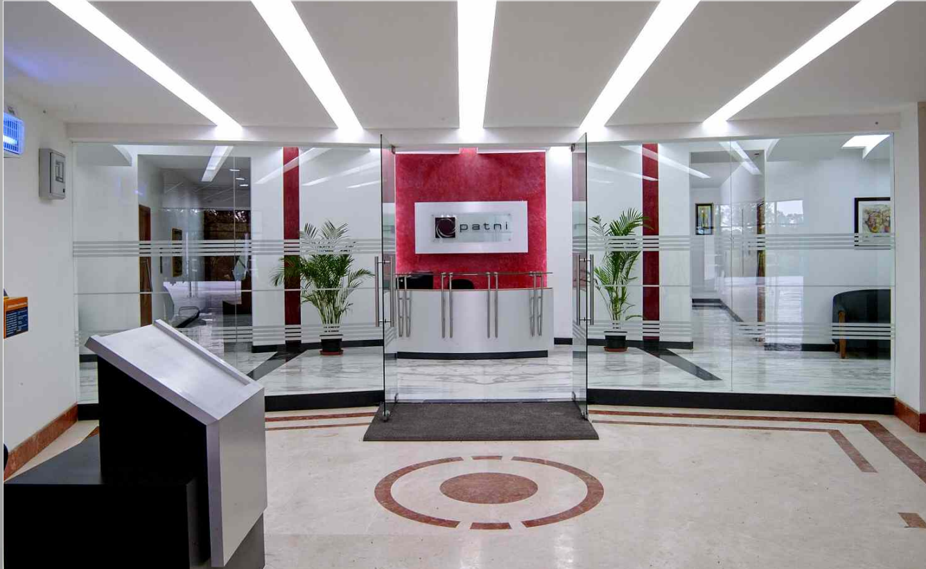
+ Main reception